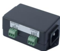
PowerEgg 600 237