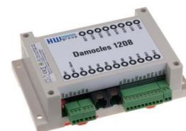
Damocles 1208 600 411