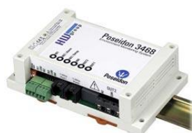
Poseidon 3468 600 349