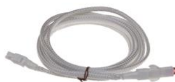
WLD sensing cable A - 2+2m 600 417